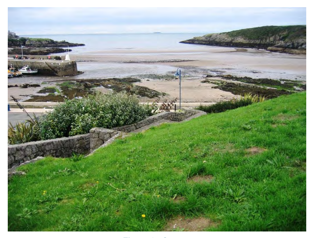
Figure 6. Cemaes

It was reported that Cemaes was a popular location for family days out on the beach on warm summer days. The beaches were also very popular places for walking and dog walking, and although dogs were not permitted on the central part of the beach during the summer, they were allowed on other parts of the beach all year. People were recorded preparing water sports equipment on the beach and a beach warden patrolled the beach through the summer. Angling took place from the rocks and the harbour wall and swimming and kayaking took place out in the bay. Three commercial fishing boats, one of which also operated as an angling charter vessel, and another angling charter boat, operated out of Cemaes Harbour. Approximately 12 sailing yachts and 12 other angling boats, hobby fishing boats and pleasure craft were moored in the harbour at the time of the survey. Two individuals were recorded undertaking boat maintenance in the harbour at low tide, one of whom also spent time fixing moorings.