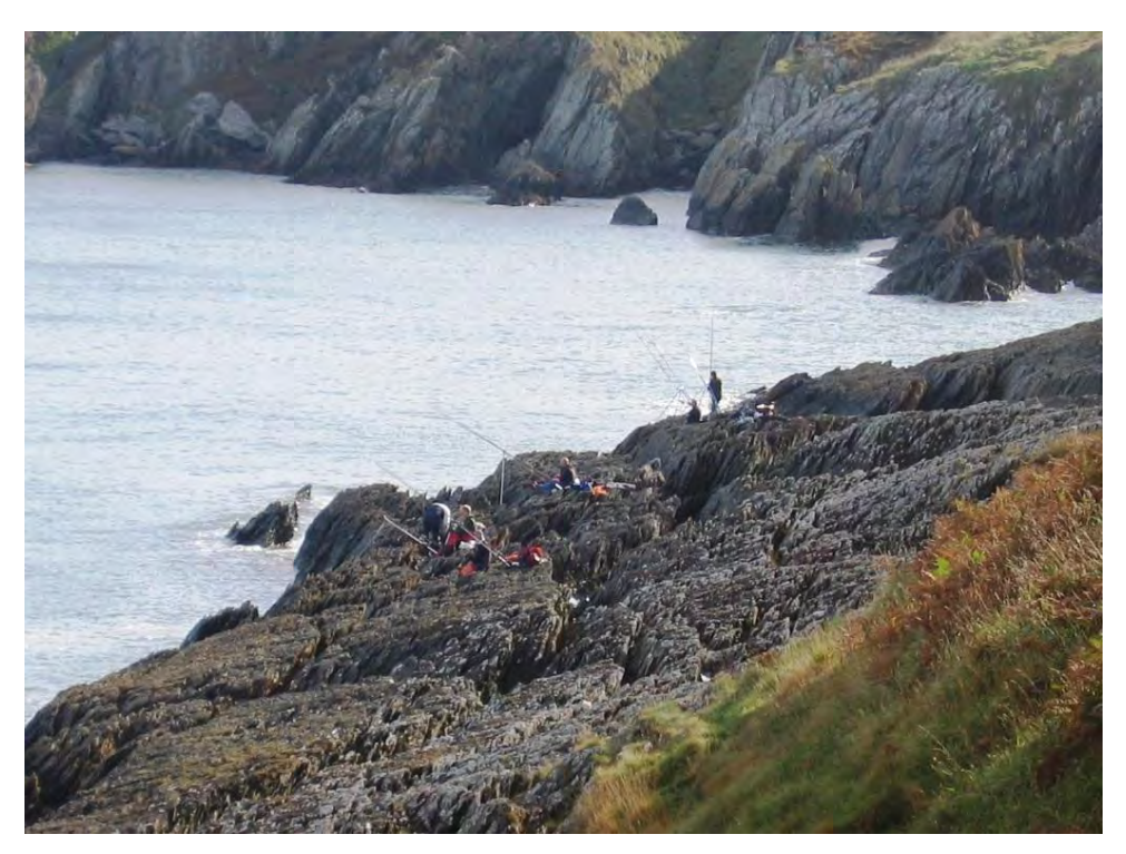
Figure 8. Anglers on the rocks at Bull Bay

Numerous activities were recorded or observed taking place out on the water of the bay including boat angling, potting, power boating, pleasure cruising, water-skiing, jet-skiing, wake boarding, sailing, kayaking and canoeing.