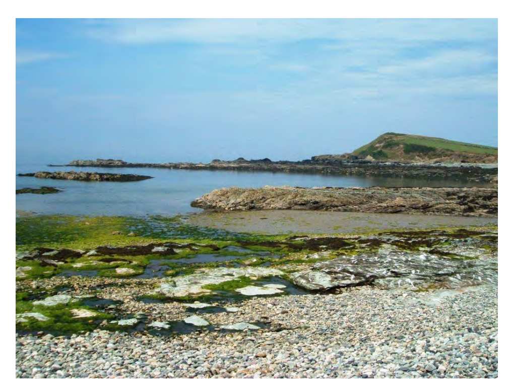
Figure 3. Hen Borth