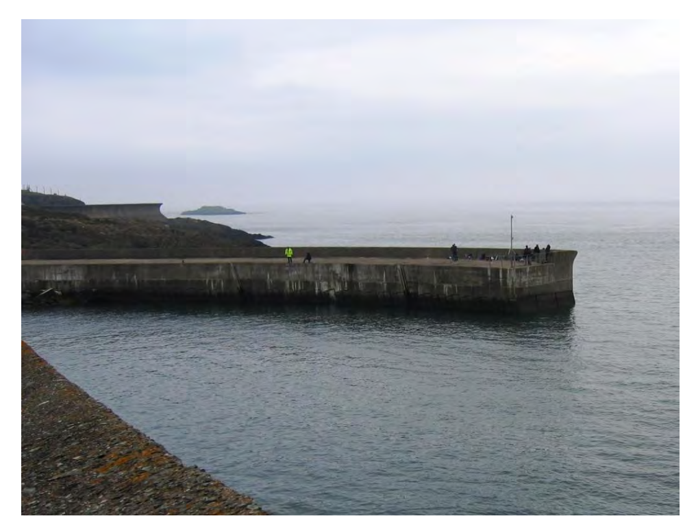
Figure 9. The harbour breakwater at Amlwch

these fished within the survey area. The port was also home to four charter vessels that catered for anglers and sub-aqua divers from all over the UK. A lifeboat, pilot boat, supply cutter, workboat and about 20 other craft including sailing yachts, angling boats, hobby fishing boats and pleasure cruisers were using the harbour. Jet skiing, wake boarding, boat angling, potting, pleasure cruising and canoeing were recorded taking place offshore.