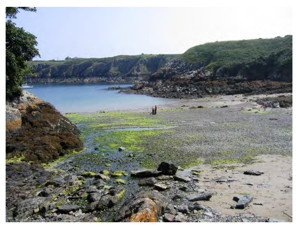
Figure 10. Porth Eilian