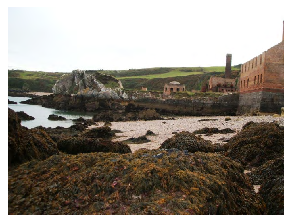
Figure 7. The brickworks at Porth Wen

Approximately one kilometre further east along the coast from Hell's Mouth is the rocky bay of Porth Wen. There is a derelict brickworks on the western shore of the bay (see Figure 7), fronted by a stone beach with patches of sand. By land the shore could only be reached by long walks, but the bay was a popular destination for pleasure boats sailing from other ports along the coast. Two walkers were identified on the beach and a school group had paddled along the coast from Bull Bay in kayaks and were swimming off the brickworks.