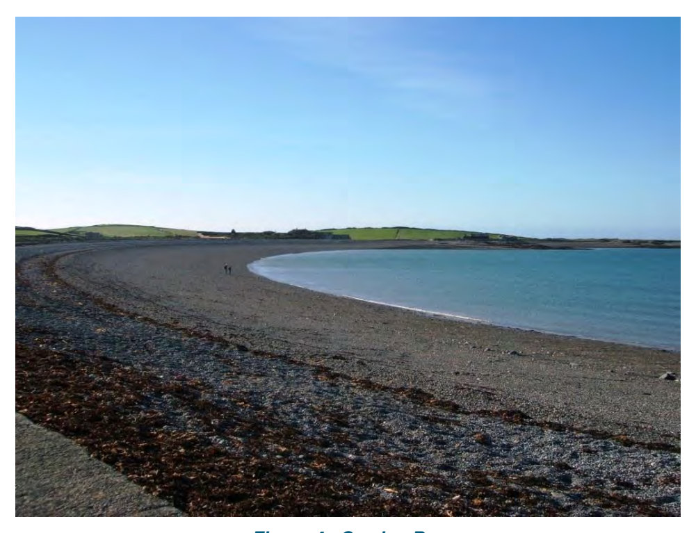
Figure 4. Cemlyn Bay

Porth-y-pistyll, also known locally as Cestyll beach, is a small cove located between Cemlyn Bay and Wylfa power station, which can only be reached by foot. The substrate is a mix of rock, sand and stones. No activities were recorded there at the time of the survey.