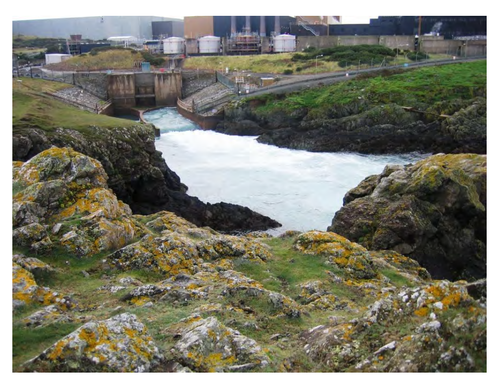
Figure 5. The outfall at Porth Wnal