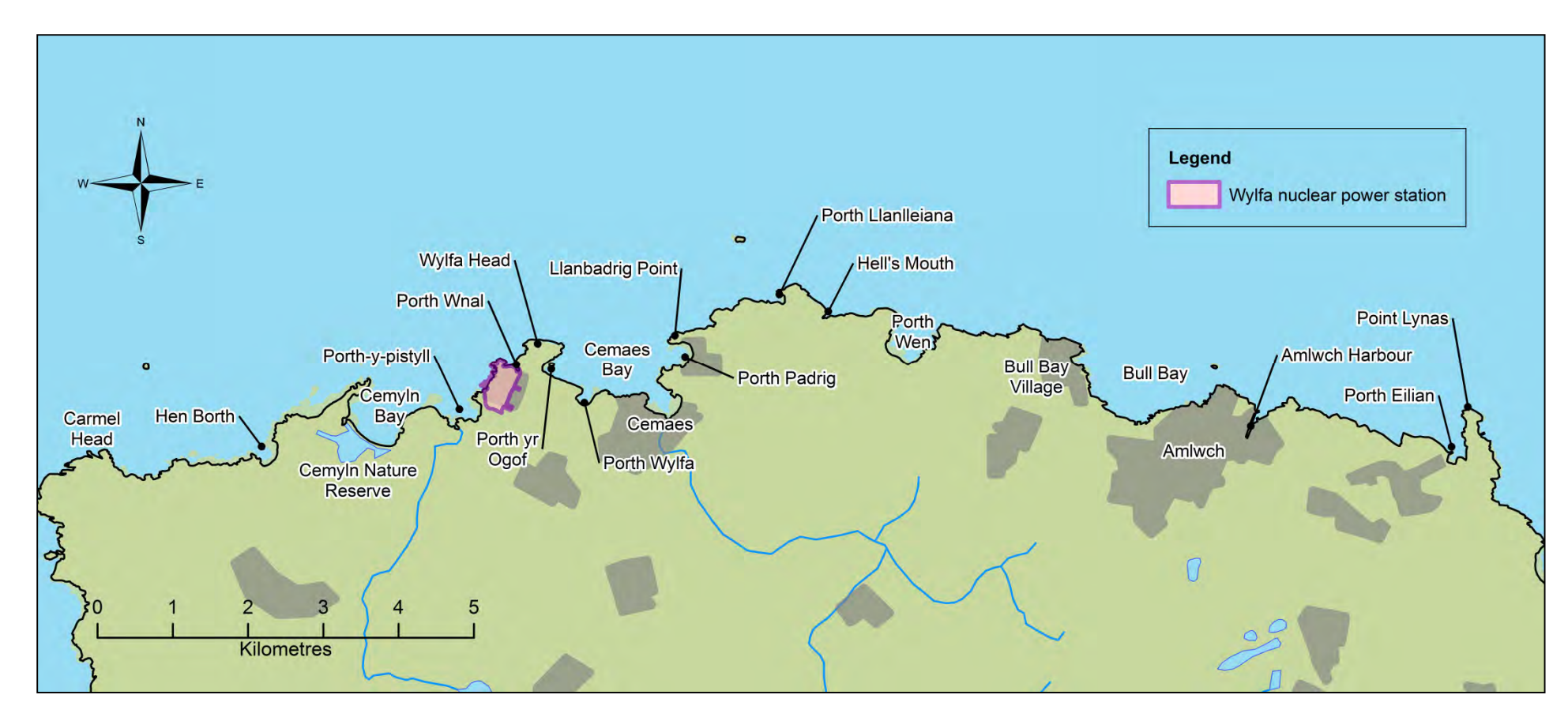
Figure 1. The Wylfa aquatic survey area