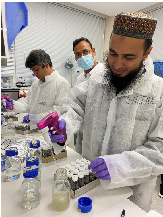
Figure 2; Workshop delegates training in the laboratory.

World Class Science for the Marine and Freshwater Environment