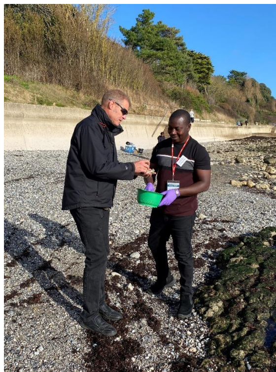
Figure 3; Reference Centre staff and delegates carrying out the shellfish sampling exercise.

These training workshops were very well received by the delegates with 100% of participant feedback scores for different workshop elements (content, presentations, practical sessions, administration, accommodation, and workshop location) in good or very good brackets (87% very good including 100% of scores for workshop content; see Appendix 2).