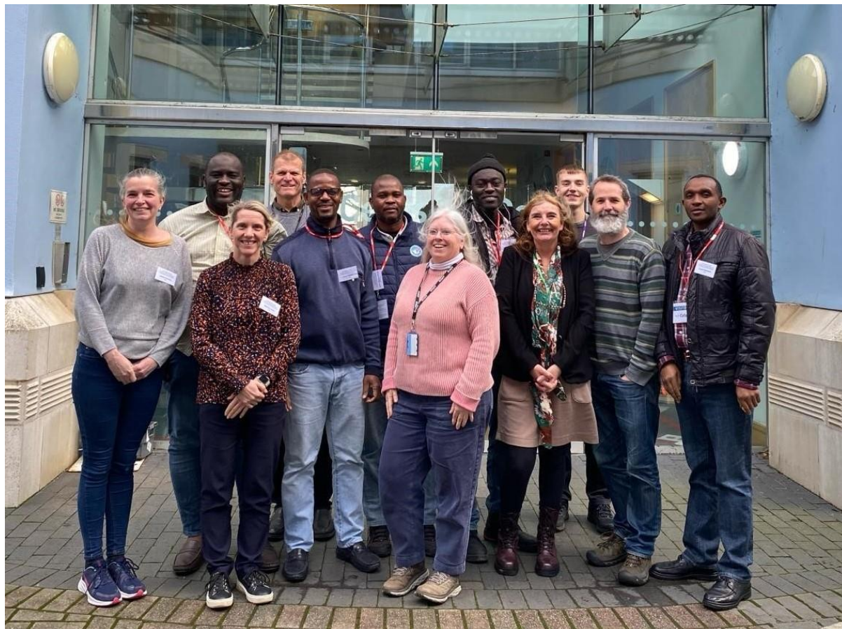
Figure 1; Reference Centre staff and delegates at one of the training workshops

World Class Science for the Marine and Freshwater Environment