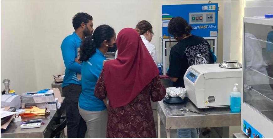
Figure 8: Microplastics laboratory established at the Maldives Marine Research Institute (MMRI)

Baseline beach sand microplastics data have been generated for multiple years, providing the Maldives with its first consistent evidence on spatial and temporal trends. Complementary water quality activities have included a pollution proof-of-concept study and the development of a forward work plan for data collection, equipment provision and staff training, laying foundations for more systematic national monitoring.