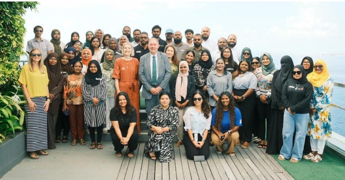
Figure 11: The second Gender, Equality, Disability & Social Inclusion (GEDSI) workshop held in October 2025