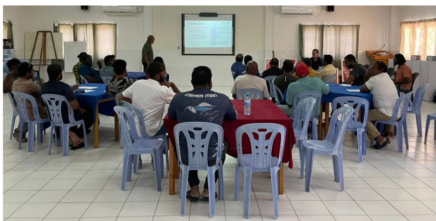
Figure 6: Abandoned, Lost, & Discarded Fishing Gear (ALDFG) workshop with Government and fishing industry representation

Marine pollution work has centred on building an evidence base and national capability to address plastics, fishing gear loss and water quality pressures. Following a national scoping study on ALDFG (early 2024), a national ALDFG baseline assessment was completed in 2025 through fisher surveys, spatial analysis and a material flow assessment focussing on the life cycle and value chain of fishing gear in the Maldives . The results were fed back to the fishing industry via outreach to agree practical recommendations to address the issue and the results of the fisher survey were ground-truthed with ALDFG data provided by the Olive Ridley Project (ORP). Findings guided an extensive outreach programme with regional fisher workshops and a national policy level workshop, raising awareness of ALDFG, validating survey data, and identifying opportunities for improved gear management and plastic pollution reduction.