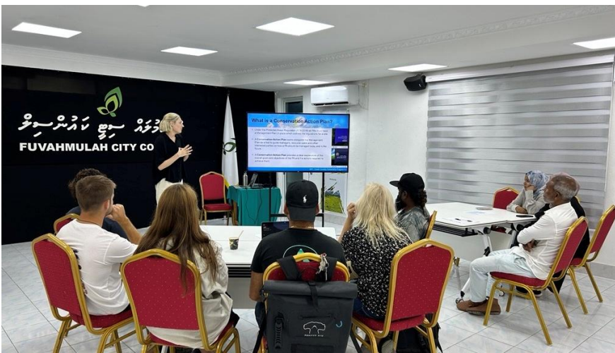
Figure 4: One of the stakeholder engagement workshops held during the development of the Farikede Protected & Conserved Area (PCA) management plan

Communications and engagement activities have reinforced technical delivery. MPA communications materials have been developed, and the Maldives PCA website was developed, providing a hub of information regarding PCAs in the Maldives, as well as a permit portal to support sustainable financing. Two PCA Forums have been planned and delivered, bringing together over 100 staff working on PCAs from across the Maldives to share knowledge, synergies and build capacity. A short course on PCAs was held in collaboration with the Maldives National University and the Ministry of Environment, helping to build a shared understanding of protected area objectives across government, practitioners and emerging professionals. This course is being used by MNU to feed into a future longer course on PCAs. International and regional engagement, including symposia and learning exchanges, has further positioned the Maldives as an active participant in global conservation dialogue.