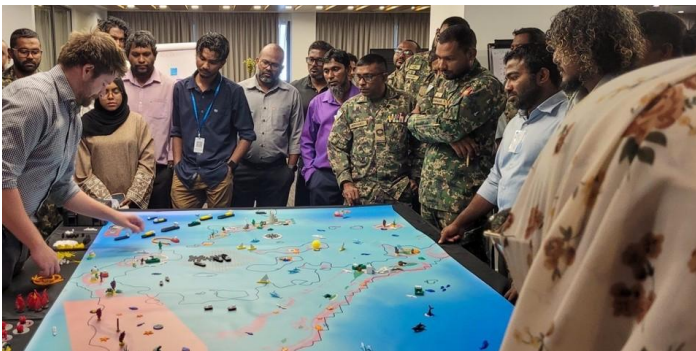
Figure 10: Marine pollution emergency response tabletop exercise

Marine pollution emergency response capacity has been significantly strengthened through an integrated programme of training, planning and equipment provision.