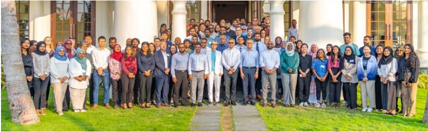
Figure 3: Protected & Conserved Area (PCA) Forum 1 held in 2024, including representation from Government, Non-Government Organisations (NGOs) and local stakeholders