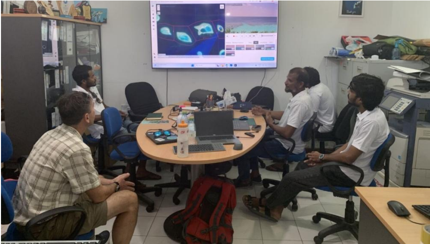
Figure 5: Training being delivered on the use of the surveillance camera system trialled at Mendhoo Island, Baa Atoll