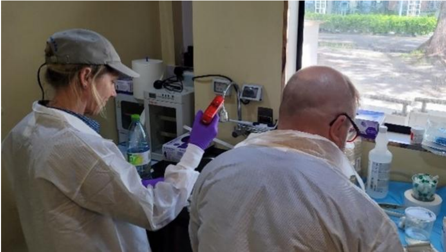
Figure 9: OCPP supported Utility Regulatory Authority (URA) as they look to grow their commitment to providing microbiology services to all of the Maldives

Cross-agency fieldwork supported ERA and the Directorate of Water and Sanitation to build evidence around effluent impacts, water quality and potential public health risks. OCPP developed a low-cost current indicator buoy system design—ready for future deployment—to improve real-time public health advisories around outfalls.