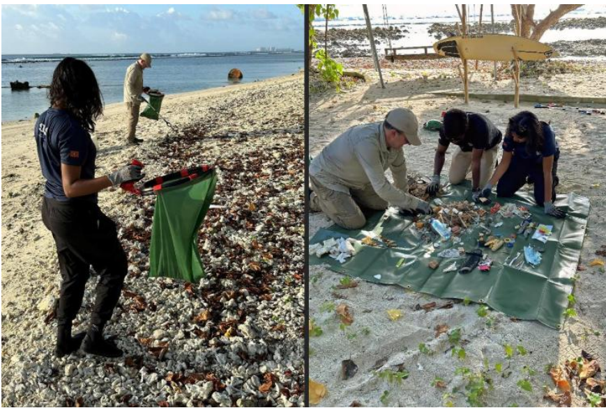
Figure 7: Beach litter monitoring; Left: Litter collection, Right: Litter classification.

Staff of Small Island Geographic Society (SIGS) were trained in the OSPAR methodology of beach monitoring including how to profile a beach, collect litter larger than 5cm, categorise litter, weigh in the field and correct disposal. The training provided will enable SIGS to conduct beach monitoring beyond the life of the programme with the potential for baseline data collection for litter on beaches and periodic monitoring to show trends over time with the potential to track the effectiveness of any interventions.